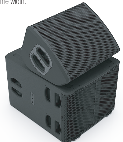
A P12 stacked on top of a L15 offers and extremely compact yet efficient drum fill.

A dedicated minimum latency setup is also available, compatible with the minimum latency monitor setups of the P12. The result is a very efficient drum-fill system, both cabinet sharing the same width.