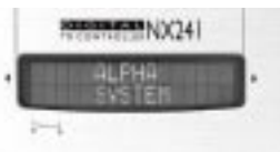
NX241 Digital TDC Controller

The Alpha S2 is an advanced high power Subbass module that can be stacked or flown together in arrays with Alpha M3, M8 and B1 and Alpha e Series cabinets. The S2 uses two Nexo specified high power 18" long excursion LF drivers in a high efficiency resonator design combined with low speed port geometry to deliver low distortion, coherent output from 32Hz to 64Hz. The S2 provides optional VLF extension of the frequency response of Alpha e Series and Alpha Systems to 32Hz.